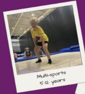
Multi-sports 5-12 years