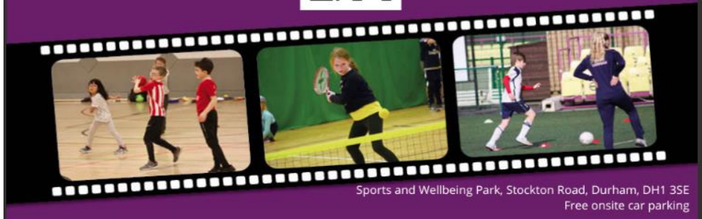
Sports and Wellbeing Park, Stockton Road, Durham, DH1 3SE Free onsite car parking