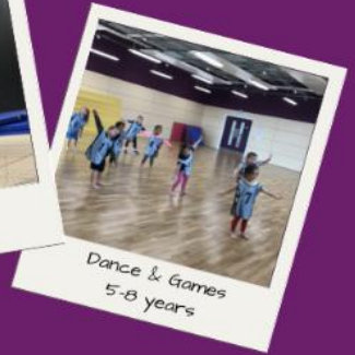
Dance & Games 5-8 years