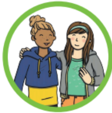
family and friends