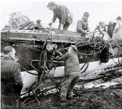
Seaham lifeboat disaster.