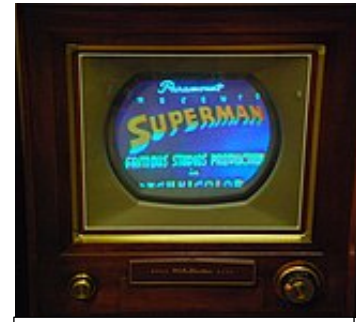
First colour TV.