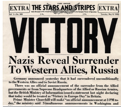
World War 2 ended.