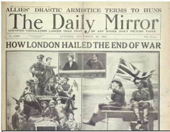
World War 1 ended.