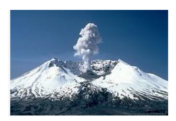
Mount St. Hellens, circa 1980.

Mount St. Helens erupted in 1980 and is still considered the worst volcanic event that has ever happened in the United States.