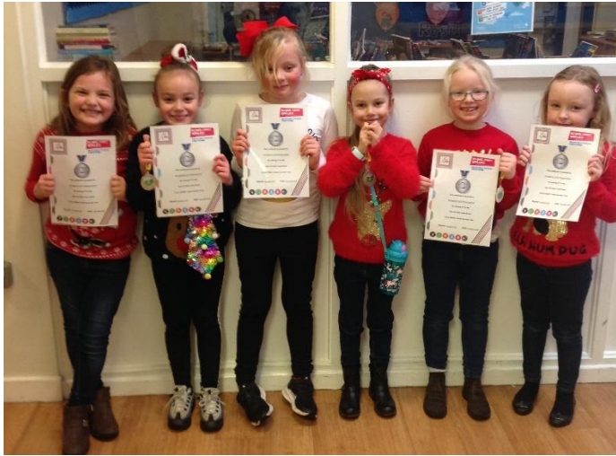
Year 3 girls