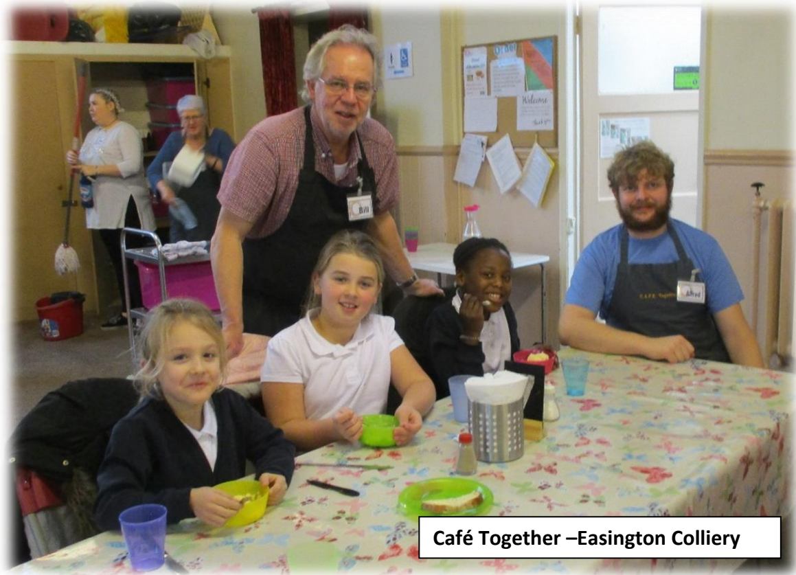
Café Together –Easington Colliery

Three of our children visited Café Together and very kindly received a freshly cooked meal. The children each gave a random act of kindness to a member of the community who were also there having lunch. They were overwhelmed by the children’s gesture. One recipient commenting that it had ‘made his year’.