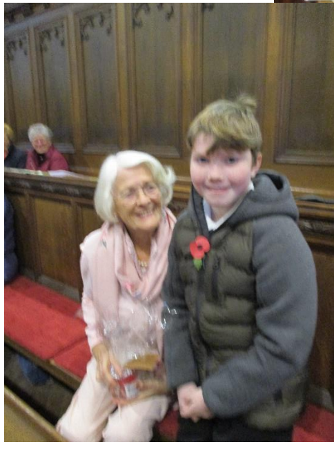
Random Act of Kindness