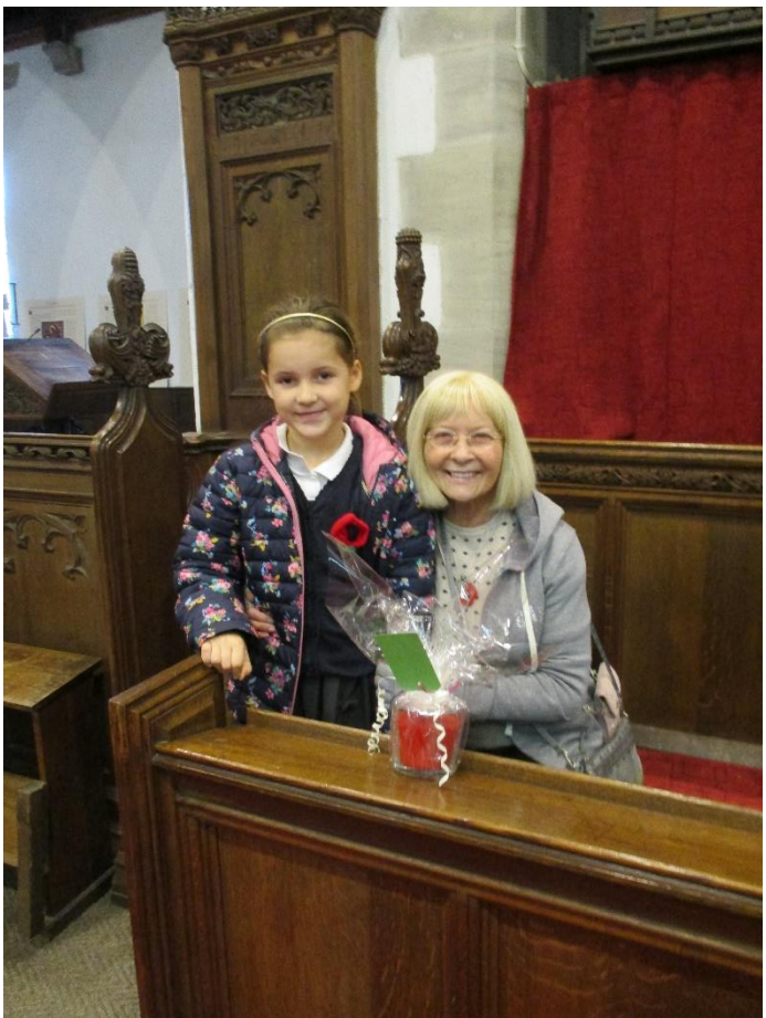
This was our first random act of kindness where the children gave candles to three members of the Church congregation. The children were a credit to the school and their families